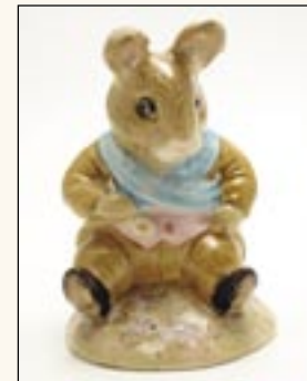
Old Mr. Bouncer Beswick $110