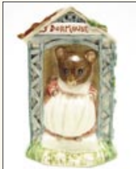
Miss Dormouse Royal Albert $125