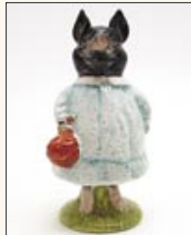
Pig Wig Beswick $475