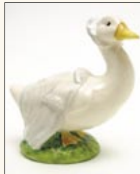
Rebecca Puddleduck Beswick $70