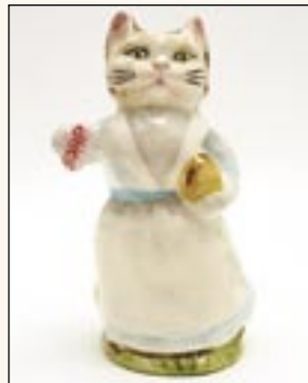
Tabitha Twitchit (White Top) Beswick $125 Royal Albert $75