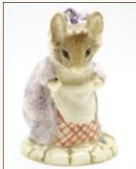
Lady Mouse Made a Curtsy Royal Albert $110