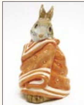
Poorly Peter Rabbit Beswick $115