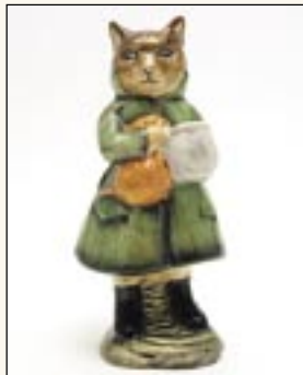
Simpkin Beswick $600