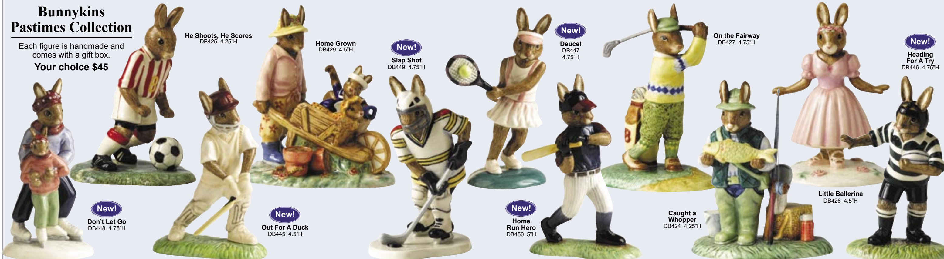
He Shoots, He Scores DB425 4.25"H

Each figure is handmade and comes with a gift box. Your choice $45