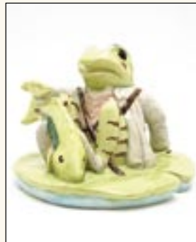
Jeremy Fisher Catches a Fish New Beswick $225