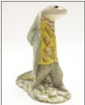
Sir Isaac Newton Beswick $400