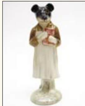
Pickles Beswick $400