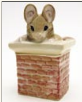
Tom Thumb Royal Albert $70