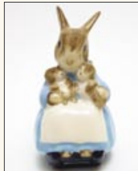
Mrs. Rabbit & Bunnies Beswick $80