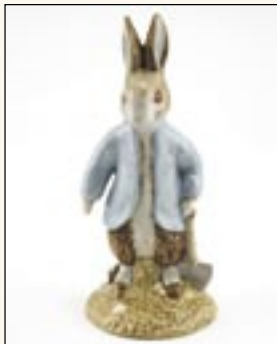
Peter Rabbit Digging New Beswick $175