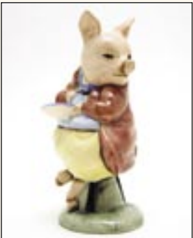
Pigling Eats Porridge Royal Albert $275