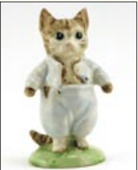
Tom Kitten (with Gold Buttons) Beswick $85