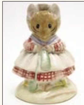
Old Woman Who Lived in a Shoe Knitting Beswick $200 New Beswick $60