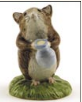
Timmy Willie Fetching Milk New Beswick $110