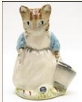
Ribby and the Patty Pan Royal Albert $60