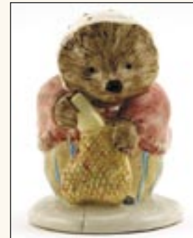
Mrs. Tiggy Winkle Buys Provisions New Beswick $325