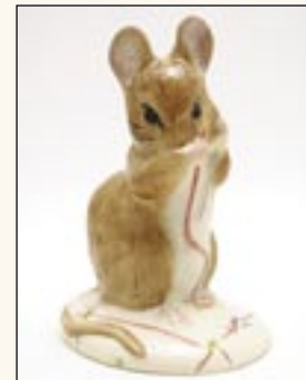
No More Twist Royal Albert $70