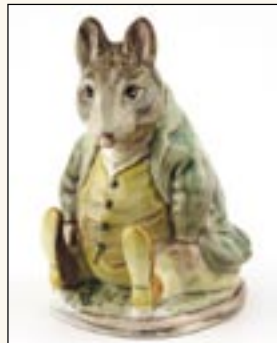
Samuel Whiskers Gold Circle $350 Beswick $115