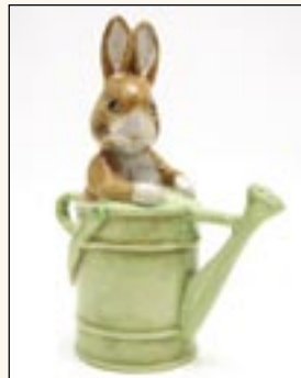
Peter in the Watering Can New Beswick $90