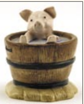
Yock Yock in the Tub New Beswick $110