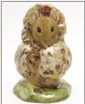
Thomasina Tittlemouse Beswick $150