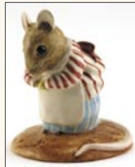
Mrs. Tittlemouse (Style Two) New Beswick $75