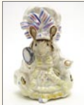
Lady Mouse Gold Oval $200 Beswick $90