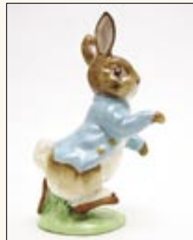
Peter Rabbit Beswick $100