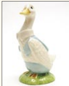
Mr. Drake Puddle-Duck Beswick $95 Royal Albert $55