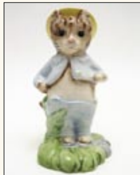
Tom Kitten in the Rockery New Beswick $60