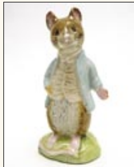
Johnny Townmouse Beswick $100