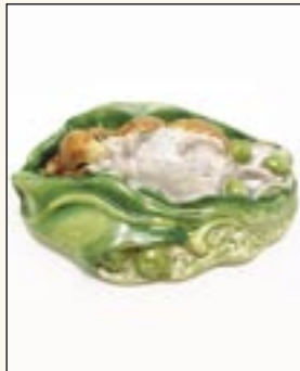
Timmy Willie Sleeping Beswick $175 Royal Albert $90