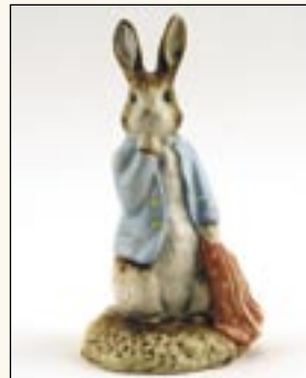
Peter and the Red Pocket Handkerchief Royal Albert $85