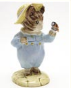
Tom Kitten & Butterfly Beswick $350