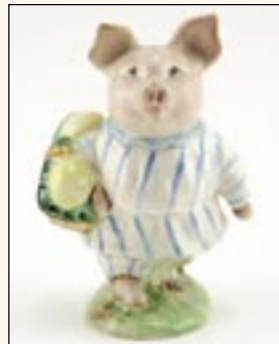
Little Pig Robinson (Striped Pajamas) Gold Oval $275 Beswick $275