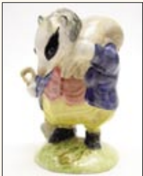
Tommy Brock (Handle Out/Small Eye Patch) Gold Oval $450 Beswick $450