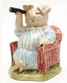
Little Pig Robinson Spying Beswick $250 Royal Albert $225