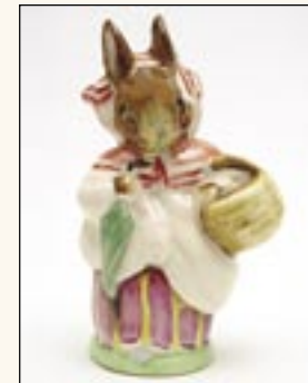
Mrs. Rabbit (Umbrella In) Beswick $80