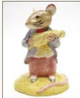
Johnny Townmouse Eating Corn New Beswick $125