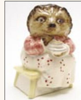
Mrs. Tiggy Winkle Takes Tea Beswick $110 Royal Albert $60