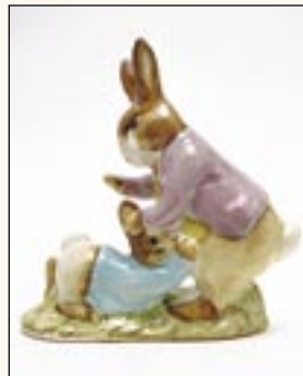
Mr. Benjamin Bunny & Peter Rabbit Beswick $175