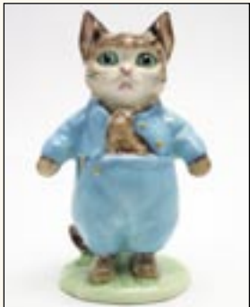
Tom Kitten Gold Oval $200 Beswick $80