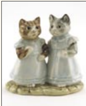
Mittens & Moppet Royal Albert $250