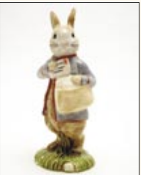
Peter with Postbag New Beswick $75