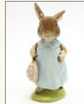
Mrs. Flopsy Bunny Beswick $90 New Beswick $55