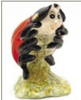
Mother Ladybird Royal Albert $175