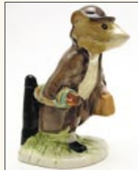
Johnny Townmouse with Bag Beswick $350 Royal Albert $325