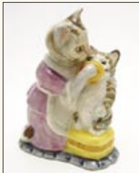
Tabitha Twitchit and Miss Moppet Beswick $175