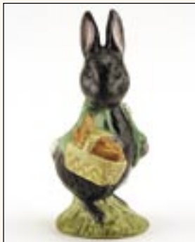
Little Black Rabbit Beswick $115