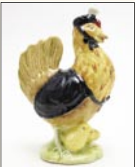
Sally Henny Penny Beswick $175