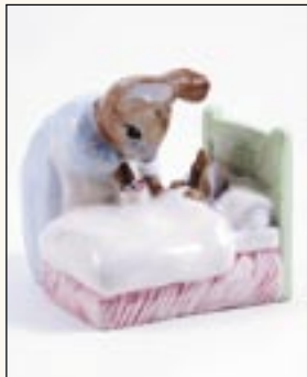
Peter in Bed New Beswick $70