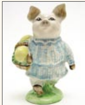
Little Pig Robinson (Plaid Pajamas) Beswick $80