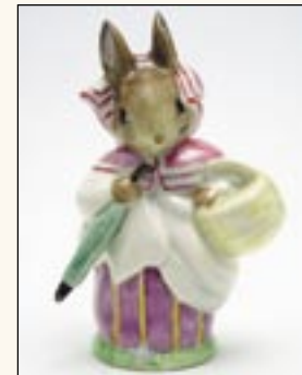
Mrs. Rabbit (Umbrella Out) Gold Oval $375 Beswick $275