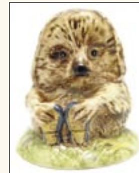
Old Mr. Pricklepin Beswick $175