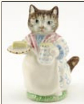
Ribby Beswick $90