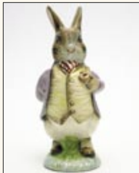
Mr. Benjamin Bunny (Pipe In/Lilac Jacket) Beswick $100 New Beswick $70