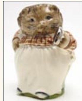
Mrs. Tiggy Winkle (Platinum Iron) Beswick Gold Script $110