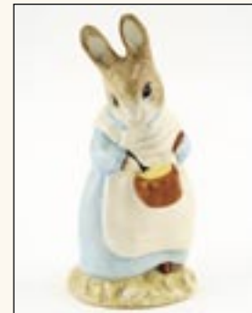
Mrs. Rabbit Cooking New Beswick $65