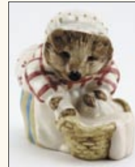
Mrs. Tiggy-Winkle Washing New Beswick $225