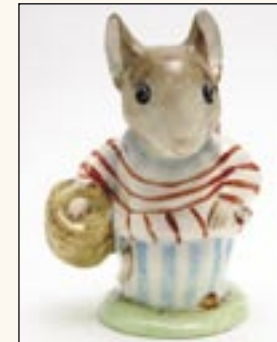
Mrs. Tittlemouse Gold Oval $175 Beswick $90