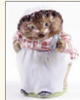
Mrs. Tiggy Winkle Gold Oval $225 Beswick $80