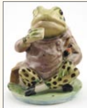
Mr. Jeremy Fisher (Spotted Legs) Gold Oval $275 Beswick $175