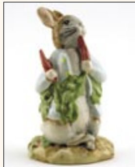
Peter Ate a Radish Royal Albert $60