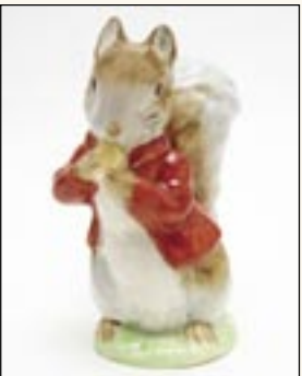
Timmy Tiptoes (Brown-Grey) Gold Oval $175