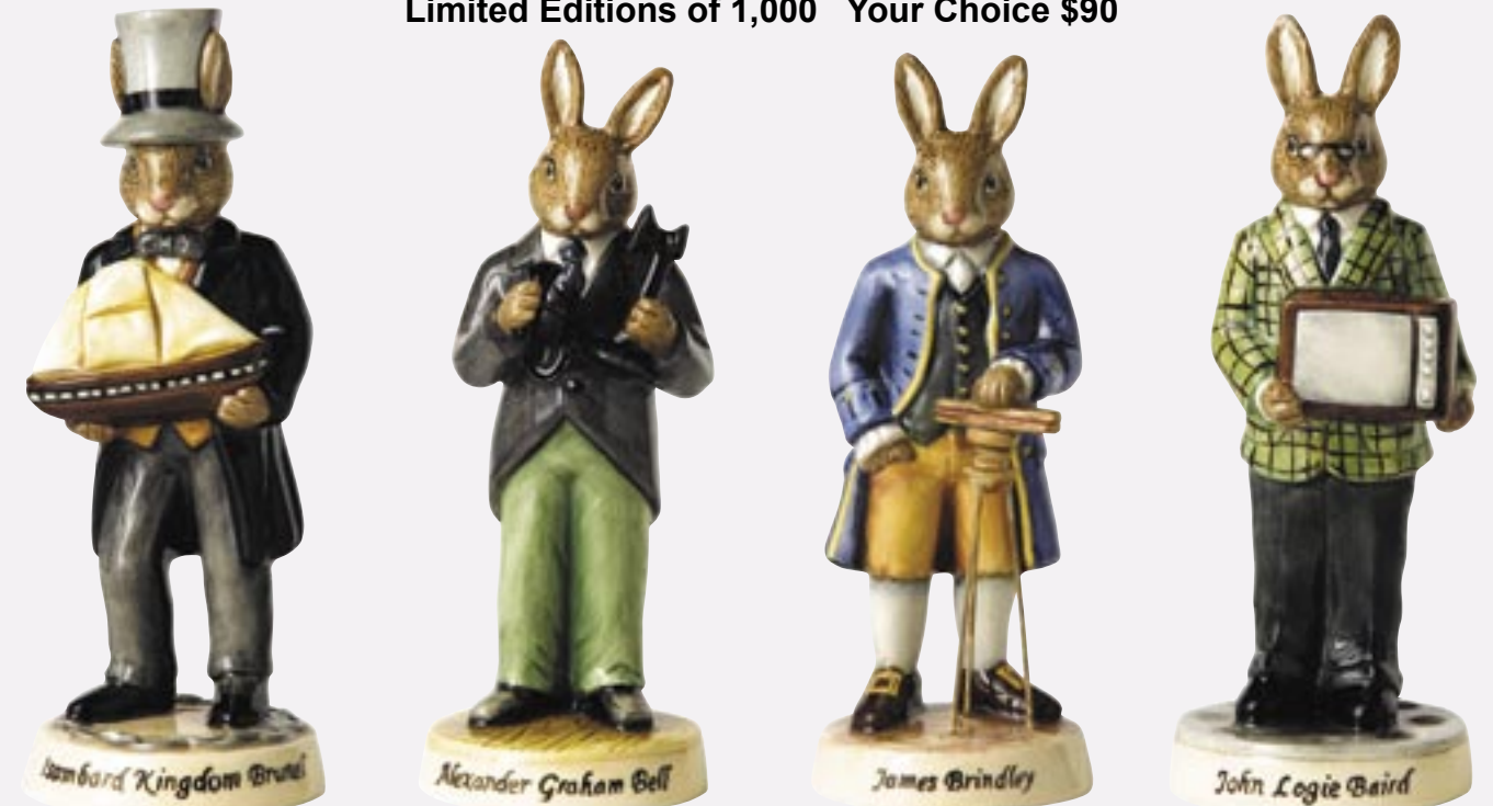
Isambard Kingdom Brunel Created famous ships DB437 5"H

Limited Editions of 1,000 Your Choice $90