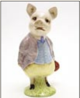
Pigling Bland (Lilac Jacket) Beswick $95