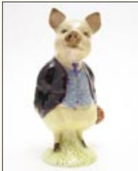
Pigling Bland (Maroon Jacket) Beswick $275