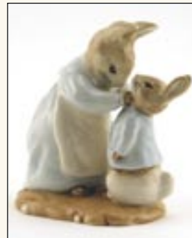
Mrs. Rabbit and Peter Royal Albert $90 New Beswick $65