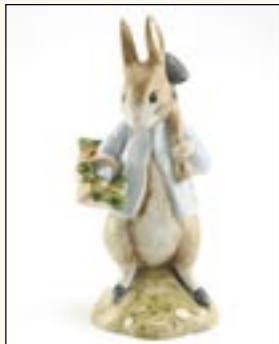
Peter Rabbit Gardening New Beswick $110