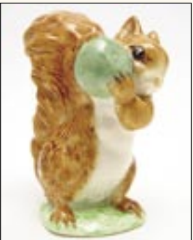
Squirrel Nutkin (with Green Apple) Beswick $80