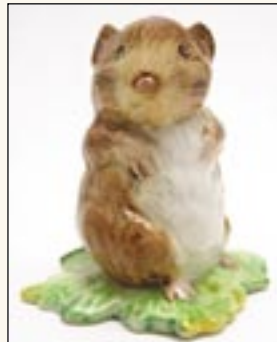
Timmy Willie From Johnny Town-Mouse Gold Oval $150 Beswick $90