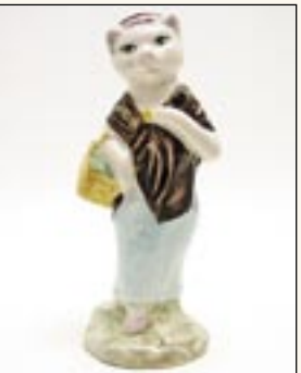
Susan Beswick $350