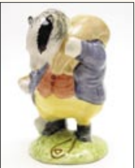
Tommy Brock (Handle In/Large Eye Patch) Beswick $75