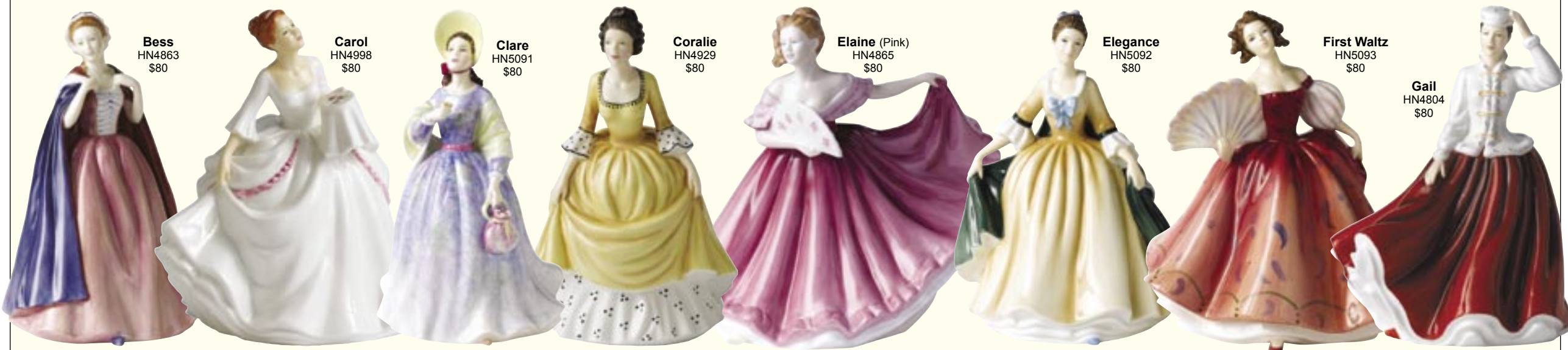
Bess HN4863 $80