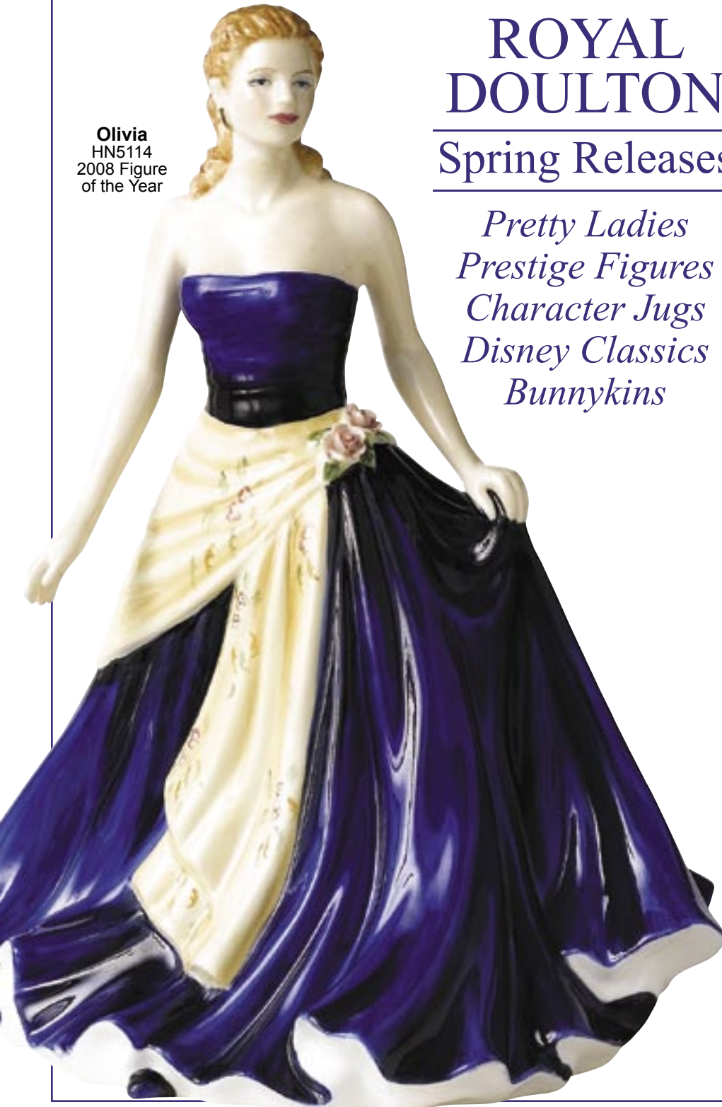
Olivia HN5114 2008 Figure of the Year