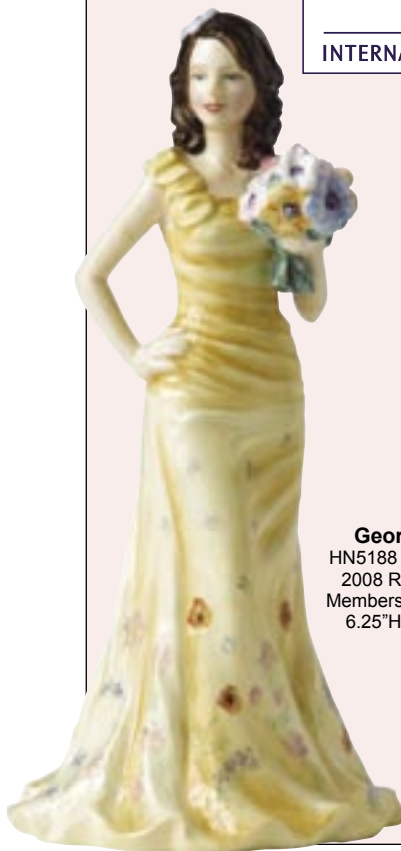
Georgia HN5188 (Earth) 2008 RDICC Membership Gift 6.25"H $50

THE ROYAL DOULTON COMPANY INTERNATIONAL COLLECTORS CLUB