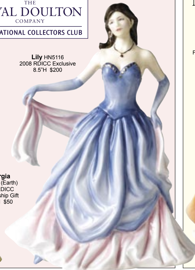
Lily HN5116 2008 RDICC Exclusive 8.5"H $200