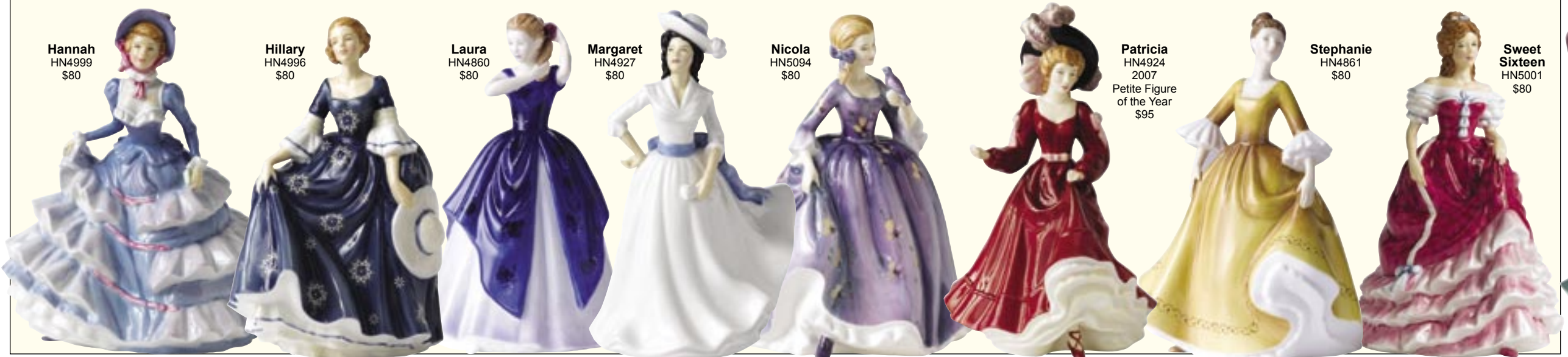
Hannah HN4999 $80