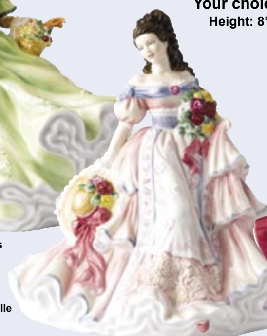
Summer's Belle HN5107