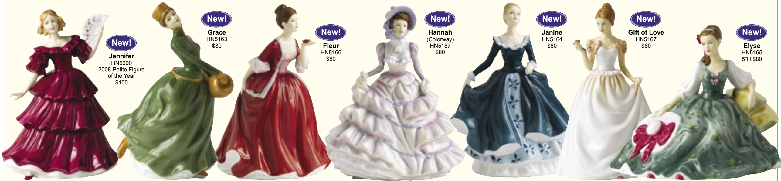
New! Jennifer HN5090 2008 Petite Figure of the Year $100

of design and craftsmanship Height: 6.75" each