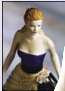
Olivia HN5114 2008 Figure of the Year 8.5"H $245